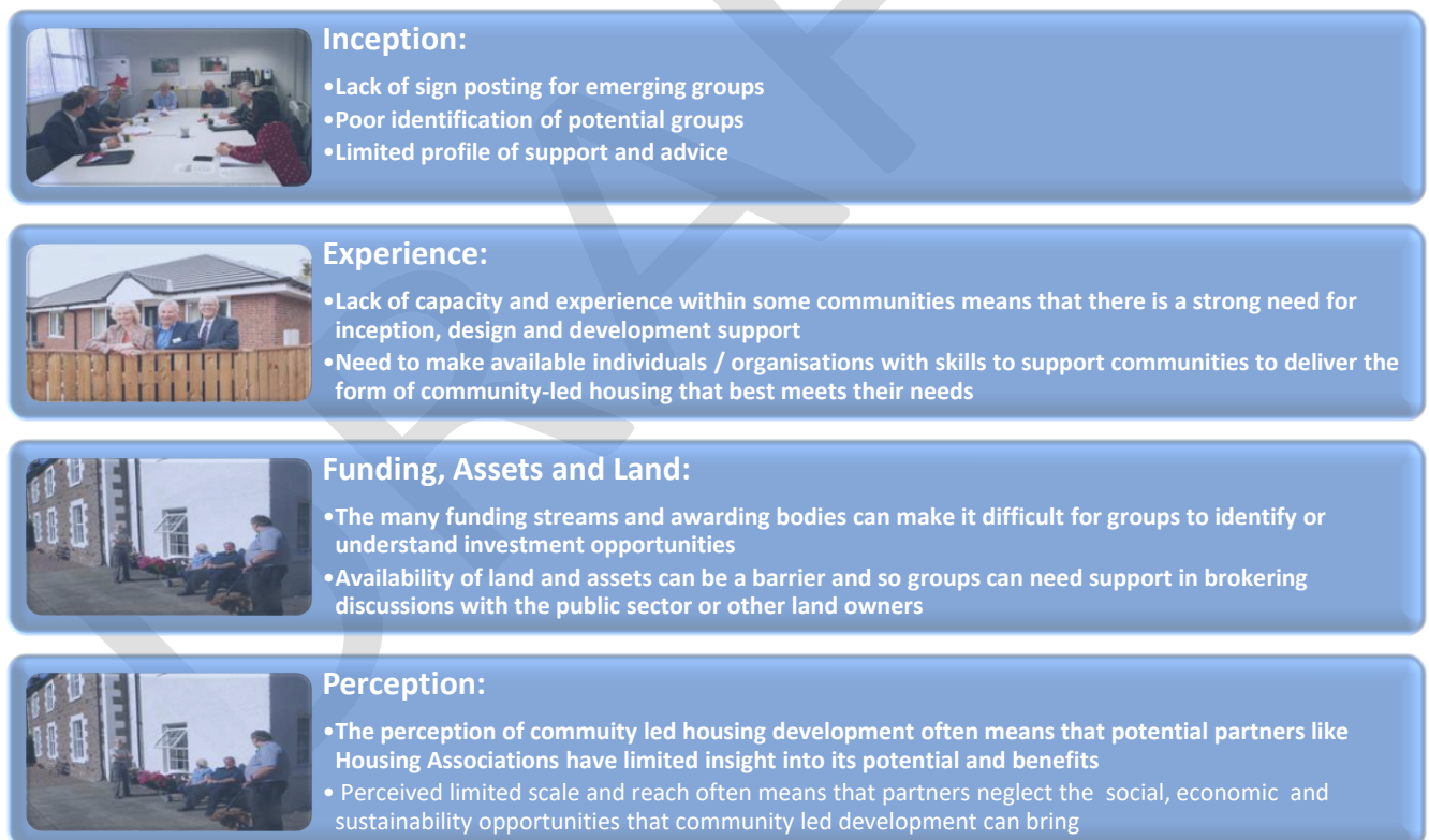
Figure 4: Key Current Challenges to Scaling Up Community Led Development

4.11 We know where we want to be, but the task is getting there. The road from community group inception to the cutting of a ribbon is a long one and we all recognise that to date there have been a number of challenges to overcome. The key challenges that we need to collectively tackle are set out below.